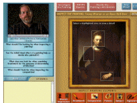
Investigate the Painting ("Inspect")

There are four modes of investigation: Inspect the painting , Compare to Similar Works , View Curator's File , or Go to the Conservation Lab . In each of these sections you can click the questions on the left to hear from art experts and to gather evidence. Each time you ask a question, a summary of the expert's answer (an "evidence point") is added to the EVIDENCE box. When you feel you've gathered enough evidence, click DECIDE THE PAINTING'S ATTRIBUTION.